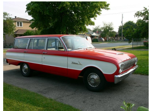
1962 Ford Falcon Wagon